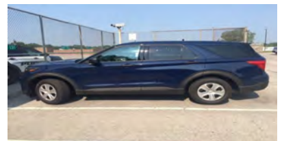
Unmarked Police Vehicle