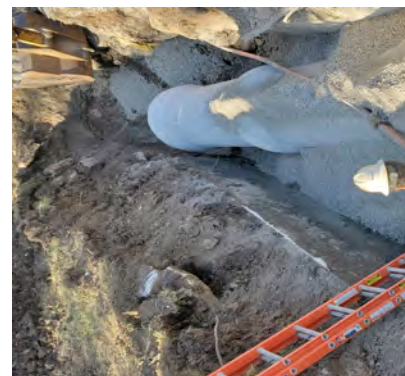
2020 Stormwater Maintenance