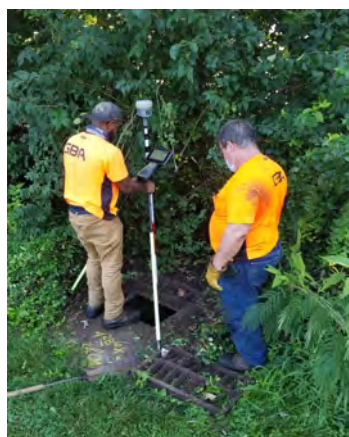
Pavement Marking object